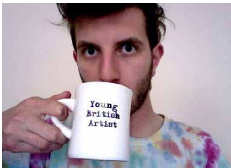
YOUNG BRITISH ARTIST Photograph Hayden Kays 2011