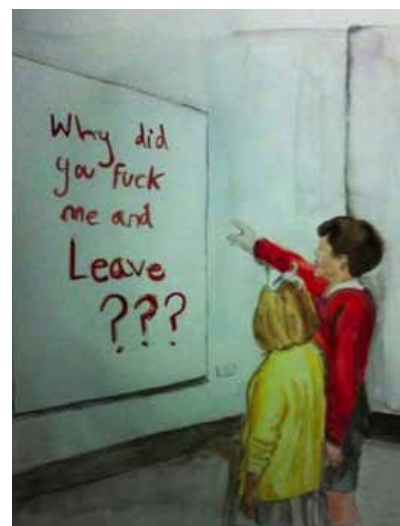
WHY THE FUCK DID YOU LEAVE ME? Water Color Illustration Miriam Elia 2011

For further information and high resolution images please email Benjamin Moore: E: ben@artbelow.org.uk T:07980298533