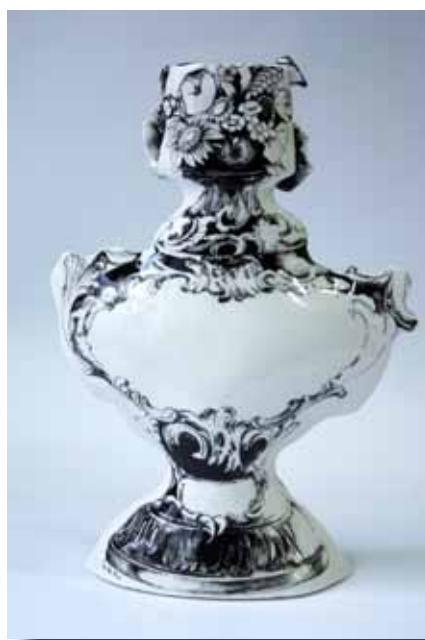
MUCH LOVED FLAT SUN AE KIM 2011