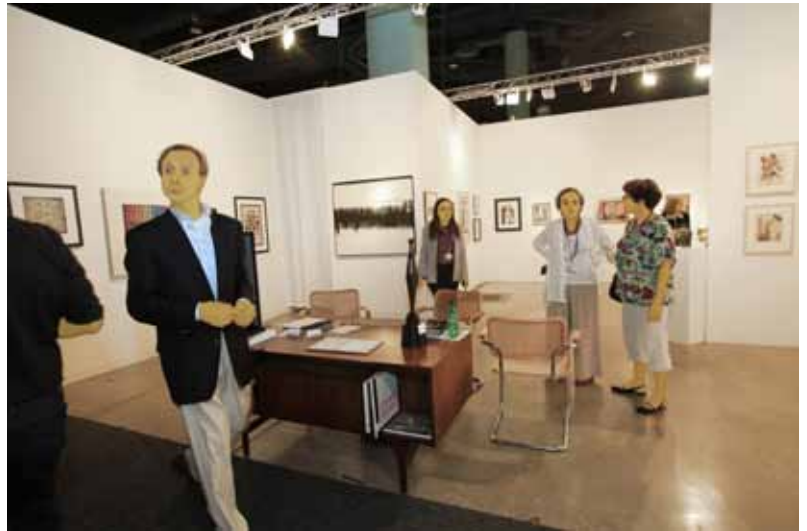
INSIDE THE SECONDARY MARKET Photography and Digital Painting Eleanor Lindsay Fynn 2011